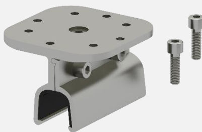
Klip lok Interface 700