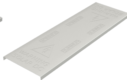
Cover with "Warning Solar DC"